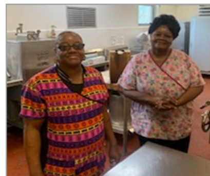
A well-deserved shout out goes to our cafeteria staff. On the last DHEC inspection scale, they scored 99 out of 100 points.

Coming Soon to DOHS COLLEGE GOAL SOUTH CAROLINA